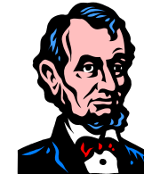
= Abraham Lincoln