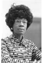
= Shirley Chisholm