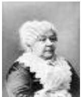
= Elizabeth Cady Stanton