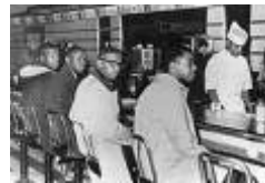
= lunch counter sit-in