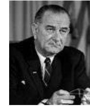
= Lyndon Johnson